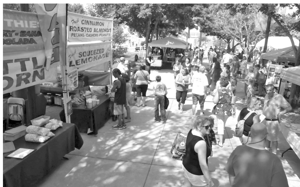
FestivalBayClosePhoto; The sun has set on Petoskey's Festival on the Bay. The Petoskey Chamber's Board of Directors voted recently to dissolve the festival after 17 years due to financial concerns.